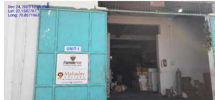
Site Exterior Picture

Information contained in this section is as provided by the applicant MSME, relevant to the requirements contained in this Certification Level. The Photographs depicted are geo-tagged & time-stamped and have been uploaded by the applicant through the ZED online systems.